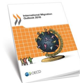
Permanent immigration by category of entry into selected OECD countries, 2015