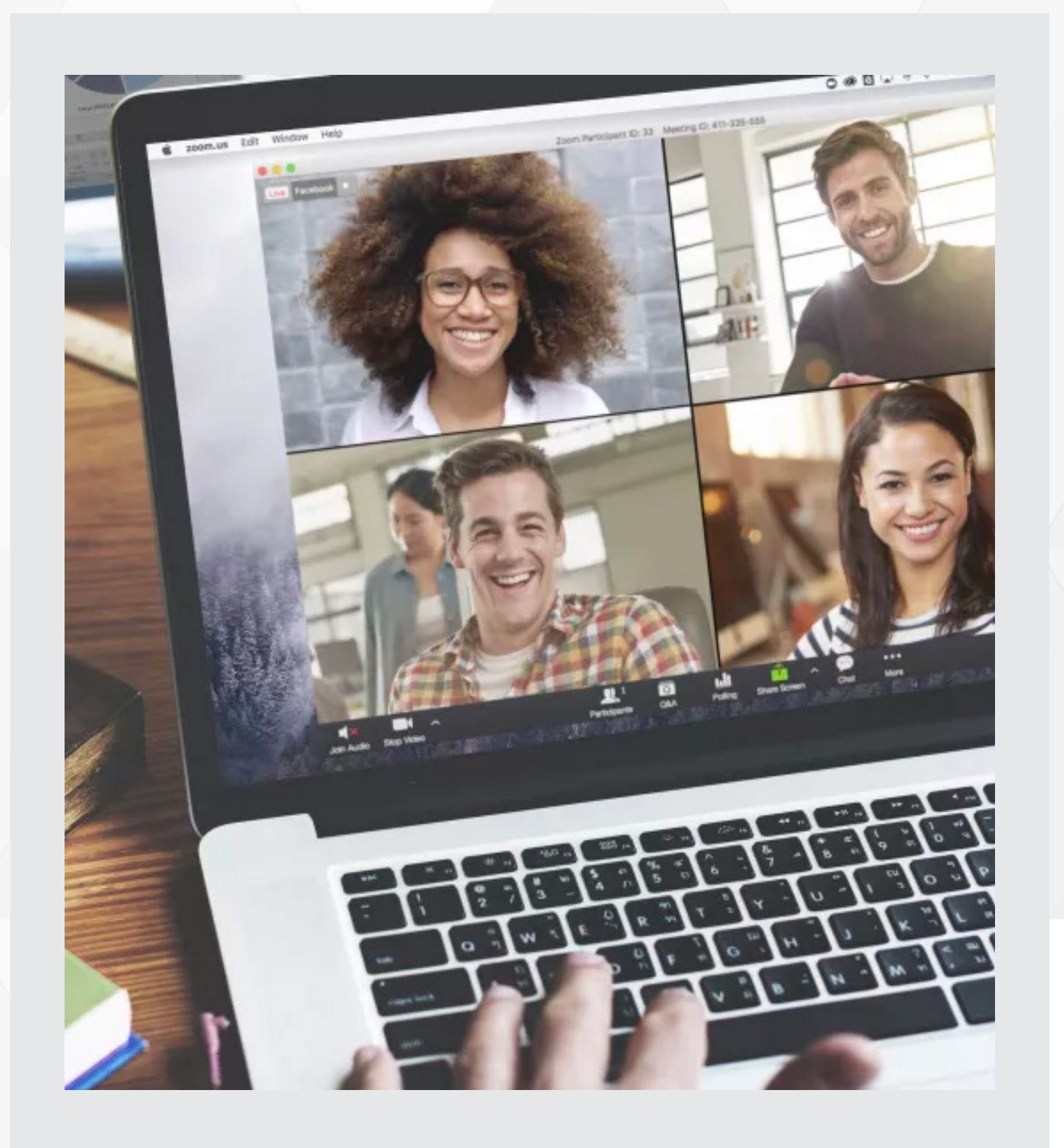
(The above image displayed is for illustration purposes only).

The Chair is aware that some employers block access to Zoom for security and compliance reasons. The decision to use Zoom was made after a lengthy appraisal of the alternatives. Where devices are blocked from accessing Zoom, delegates are encouraged to make use of personal devices.