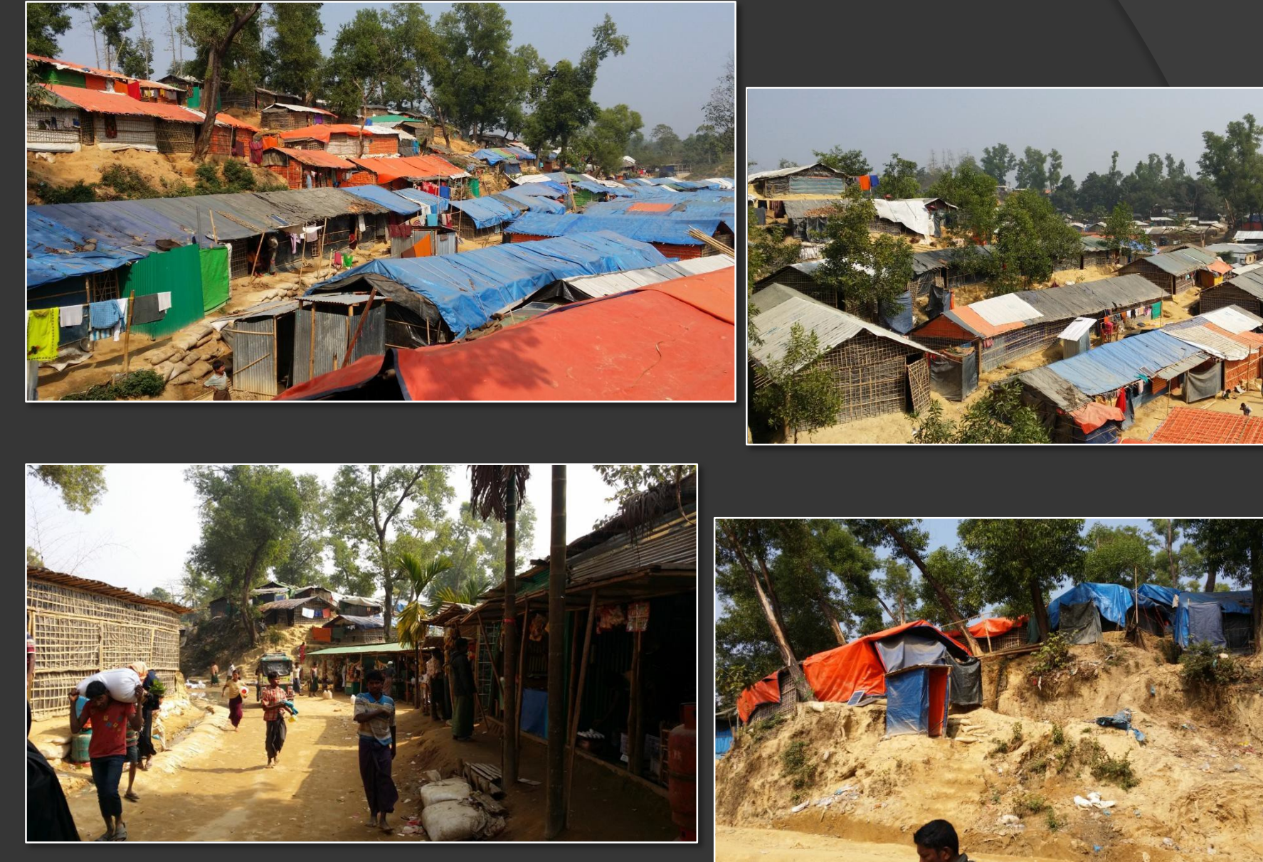
Balukhali camp, Bangladesh, January 16th, 2018 (F. Fouinat)