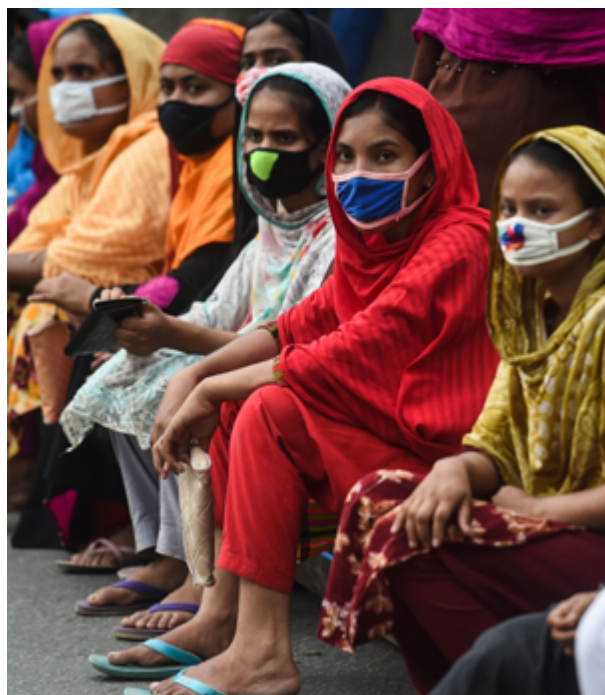
●● Dhaka, Bangladesh, April 2020. Workers from the garment sector block a road during a protest to demand payment of due wages, saying they were more afraid of starving than contracting the coronavirus.