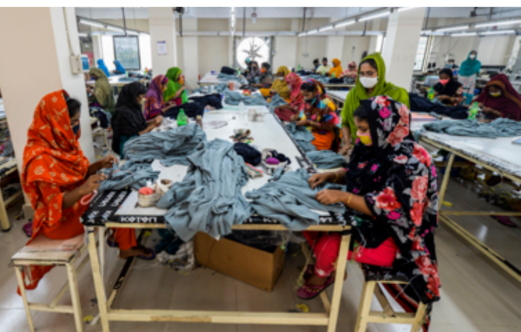
●● Asulia, Bangladesh, April 2020. Garment labourers work in a garment factory during a government-imposed lockdown as a preventative measure against the spread of the COVID-19 coronavirus.

While there has been widespread condemnation of brands that have cancelled orders already in production, there are many examples of companies honouring these commitments and taking other steps to support suppliers.