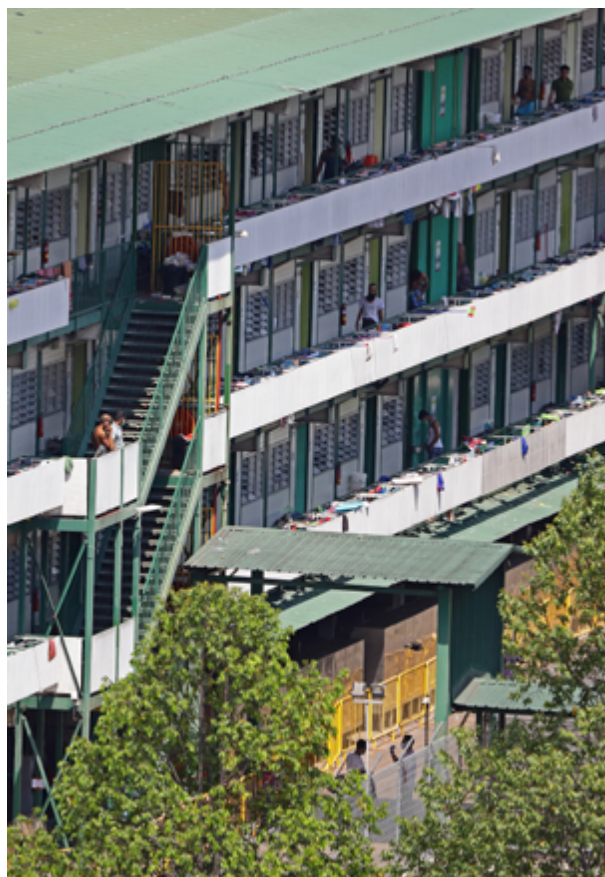
●● Singapore, April 2020. Foreign workers are seen outside their dormitory rooms at Cochrane Lodge II, which was declared as an isolation area on April 16, 2020 after the nation experienced a second wave of infections linked to foreign worker dormitories.

In Cambodia, approximately 30,000 workers have had their jobs suspended as more than 70 factories respond to cancelled orders and reduced demand. The Garment Manufacturers Association in Cambodia reports that factory owners are unable to pay workers entitlements as many buyers are refusing to pay for goods that have already been manufactured and there are no new orders. 32 A number of civil society organisations, including Human Rights Watch have condemned international clothing brands that have cancelled orders without making provision for workers in their supply chains. 33