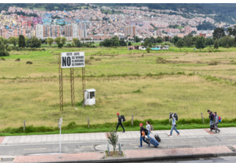
●● Bogotá, Colombia, April 2020. Venezuelan migrants walk with their belongings on the side of a highway out of Bogotá. Thousands of Venezuelan migrants living in Colombia have lost their jobs and in some cases been evicted from their homes due to the recession caused by the lock down to halt spread of COVID-19. Groups of Venezuelan gather in walking caravans and head the border crossing in Cúcuta, 550 km from Bogotá.

Governments should also consider using international aid to provide relief to vulnerable workers, such as the aid package the EU has announced for workers in Myanmar. 90 Multilateral funding efforts are also critical to protect lives as the pandemic spreads to poorer countries without resources to support workers. For example, the International Trade Union Confederation (ITUC) has called for a “Global Fund for Universal Social Protection for the poorest countries to support health care and income support,” as well as action from the International Monetary Fund to coordinate fiscal policy and establish a Trust Fund for public health, social protections, and jobs, whereby advanced economies could reallocate holdings of IMF-issued special drawing rights. 91 This will be critical as countries across Africa and Latin America, without resources to support workers start to feel the pandemic’s full impact.