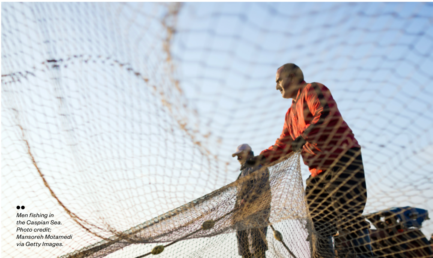
●● Men fishing in the Caspian Sea.

In Lebanon, there have been reports of increased physical and sexual assault as a result of being 'trapped' with abusive employers. 23 The International Domestic Workers Federation has reported that some domestic workers are being subjected to increasingly stressful and hazardous working environments as a result of a "substantial increase in workload to ensure cleanliness and hygiene without overtime work compensation." 24 The remainder of the workforce are facing rapid job losses. In the USA, 70 per cent of domestic workers were out of work and did not know if they would be able to return to their jobs after the pandemic. 25