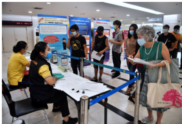
●● Bangkok, Thailand, April 2020. People stand in line to renew their visas at the Government Immigration Center in Bangkok on April 8, 2020.

Countries such as Austria, 111 Germany, 112 Switzerland, 113 Tunisia, 114 and parts of Italy 115 have made efforts at ensuring migrants have access to information about COVID-19 and/or the government's response by making information available in multiple languages.